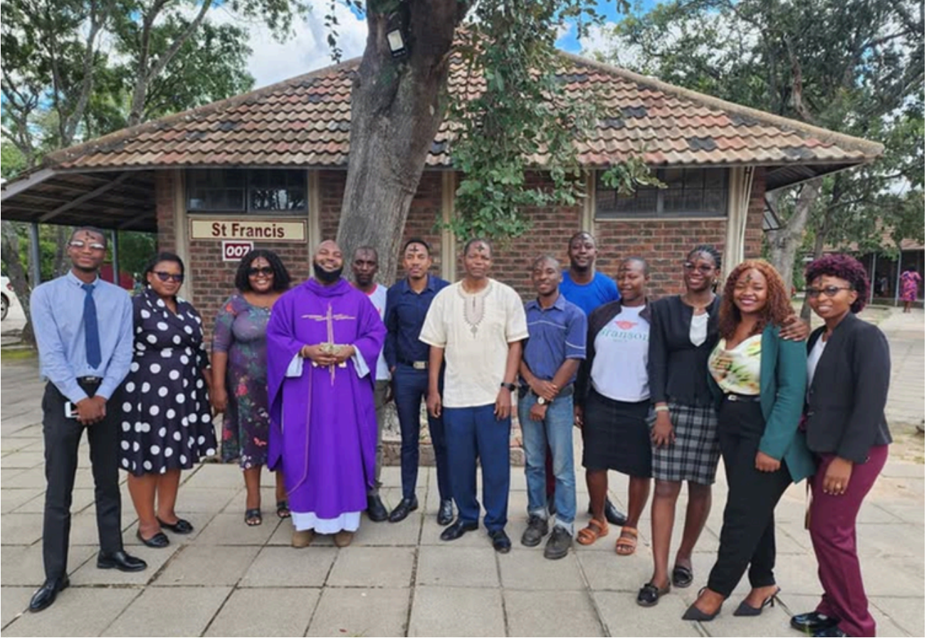
CUZ members of staff, after Ash Wednesday Mass Celebrations