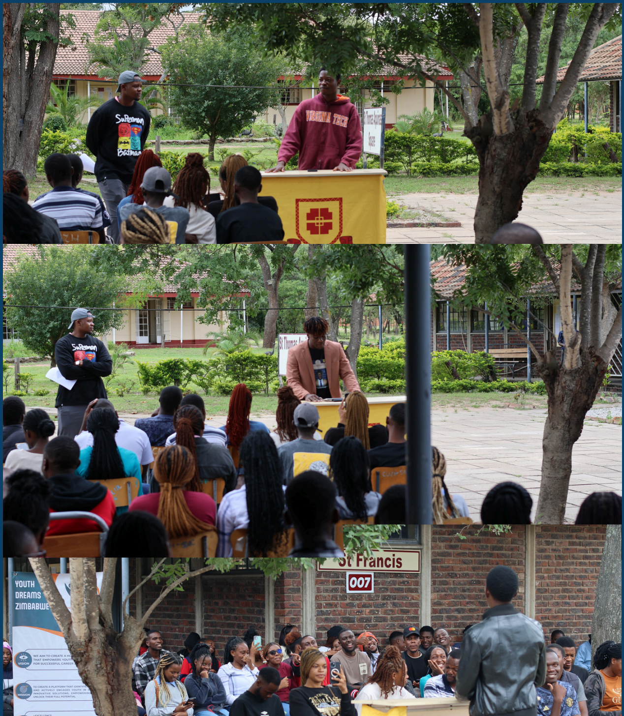
More pictures from the SRC Candidates Public Engagement