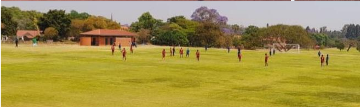
Left: Roman Flames playing at the Arrupe Sports Day