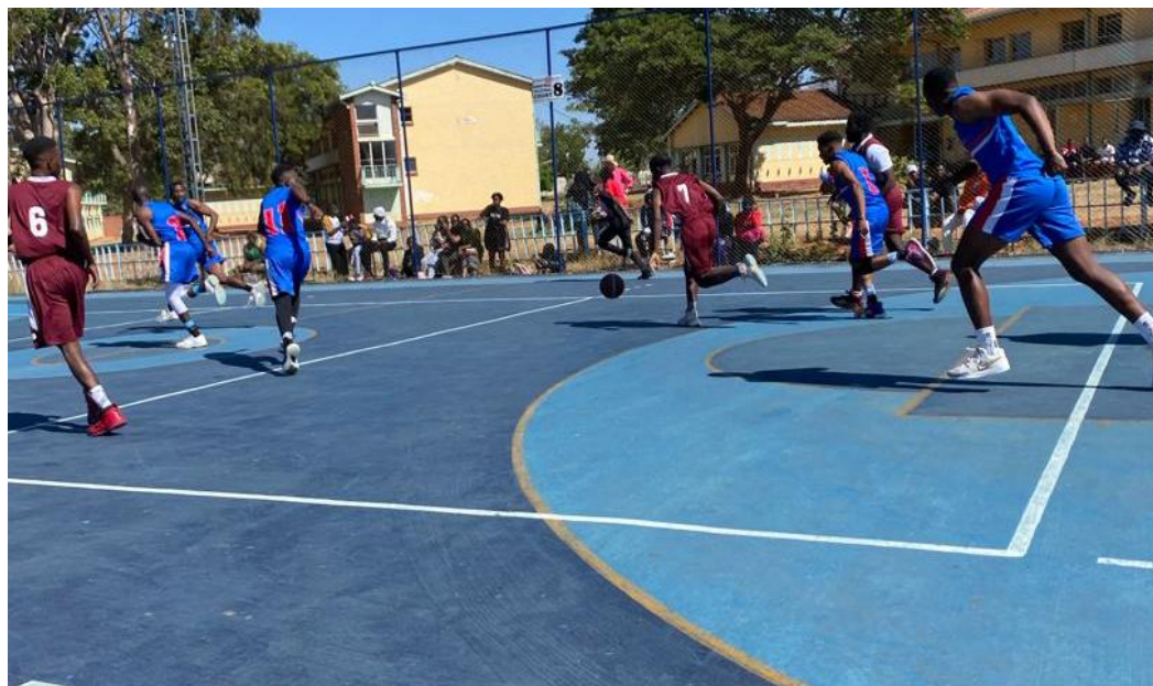
Right: CUZ Basketball Team during play against Team UZ at the MSU Courts in Gweru