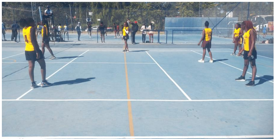
Above: [from left] The Team Members of the Roman Flames (CUZ Soccer team) and the CUZ Ladies Volleyball team