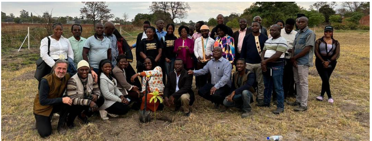
Above: Group photo after tree planting for the Earth Week Launch