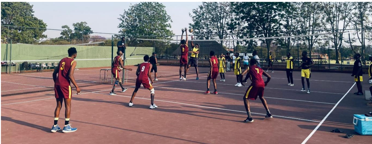
Left: CUZ Volleyball Team playing Chishawasha Seminary at the Arrupe Sports Invitation

The day was full of joy, unity, and fierce competition. We're so proud of our teams for their dedication and focus! 💪 🔥