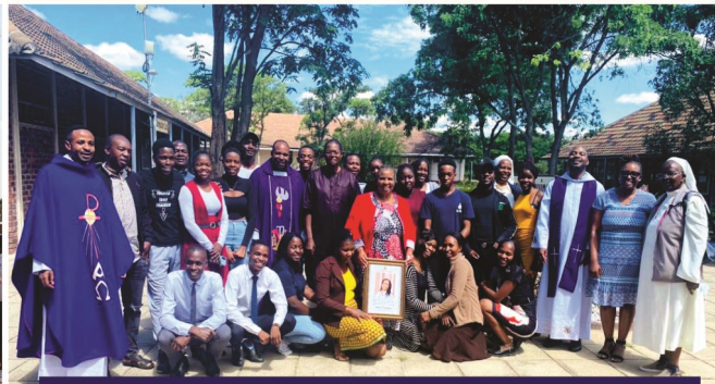
THANKS GIVING MASS