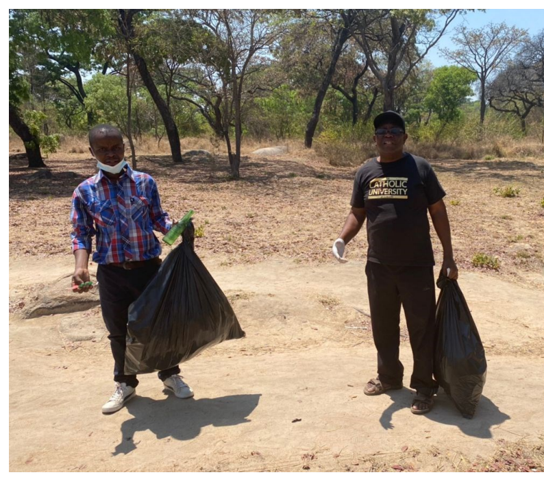
CUZ Members of Staff and students planting trees and cleaning up the environment