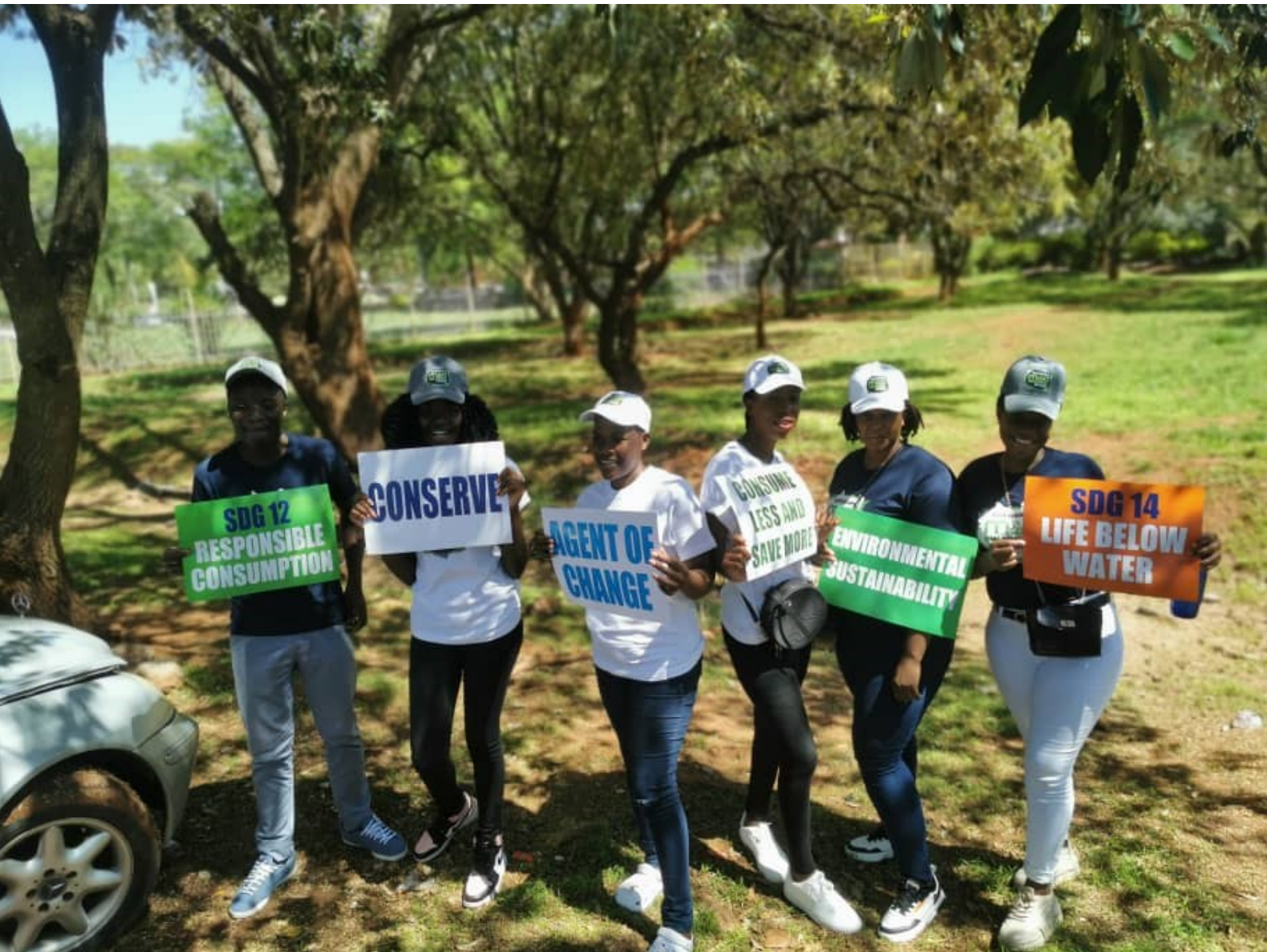
Students pose for a picture at the competition grounds