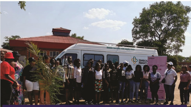
BREAST CANCER MONTH